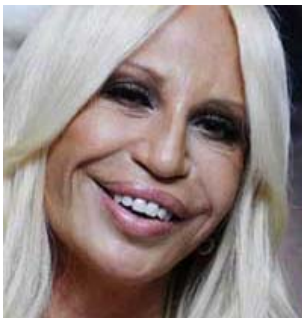
Donatella Versace Clearly using the same plastic surgeon as Angelina Jolie