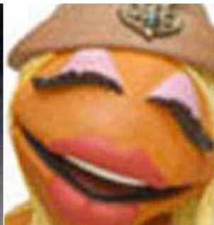
Janice the Muppet